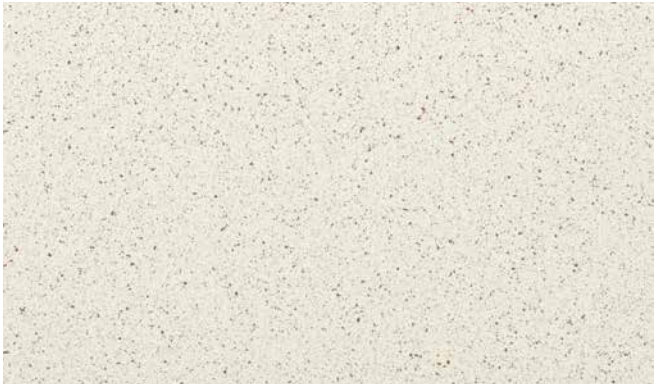
White Stone Y4310N