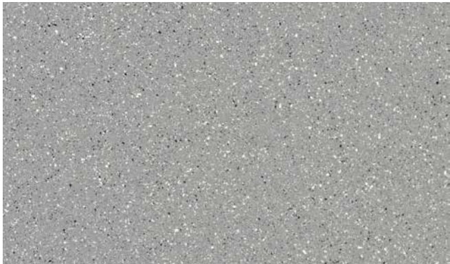
Light Grey Natural Concrete Y4313N