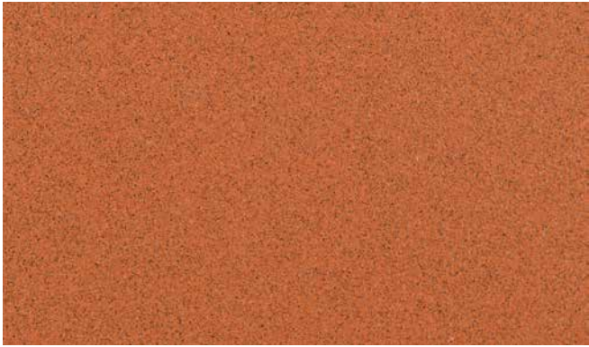
Red Brick Y4316N