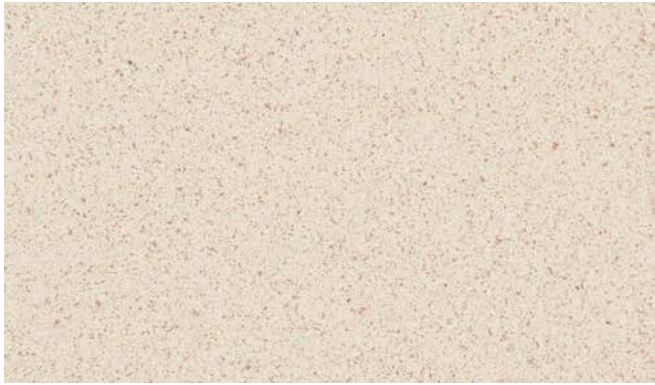
Portland Stone Y4312N