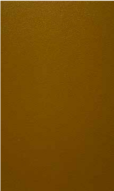
Men RG Brown - Basecoat