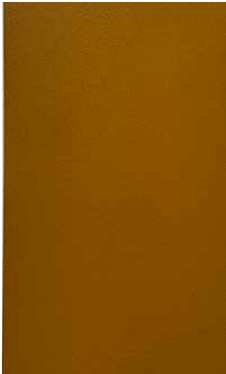
Koya koka - Basecoat YZ306N