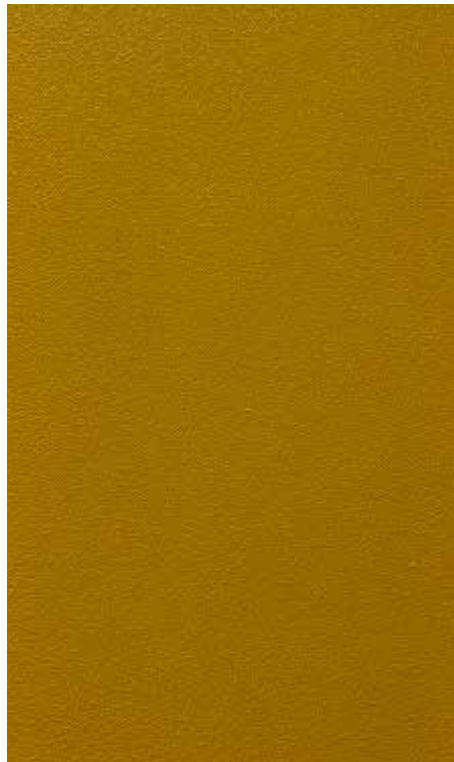
Men Brown - Basecoat YZ311N